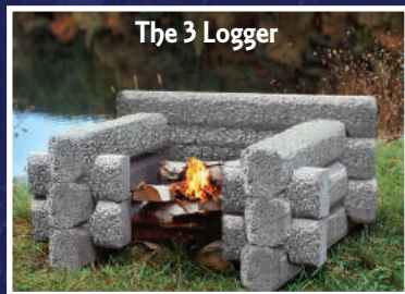
The 3 Logger

The Three Logger 3½' w x 3' d x 1½' h. Weight: 600 lbs.