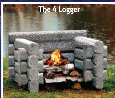
The 4 Logger

The Four Logger 3½' w x 3' d x 2½' h. Weight: 800 lbs.