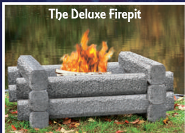
The Deluxe Firepit

The Deluxe Firepit for those who feel bigger is better. 3½' square. Weight: 650 lbs.