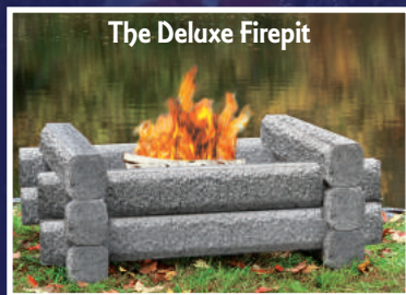
The Deluxe Firepit

The Deluxe Firepit for those who feel bigger is better. 3½' square. Weight: 650 lbs.