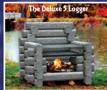
The Deluxe 5 Logger

*Optional Colors at additional cost, (please call for pricing.)