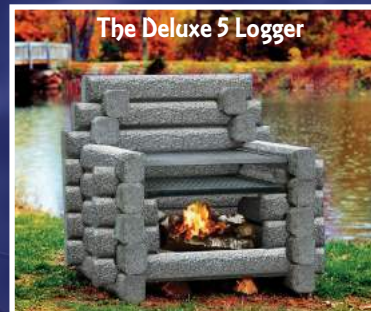
The Deluxe 5 Logger

*Optional Colors at additional cost, (please call for pricing.)