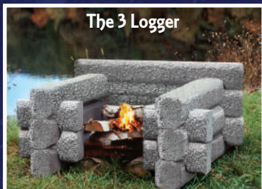
The 3 Logger

The Three Logger 3½' w x 3' d x 1½' h. Weight: 600 lbs.